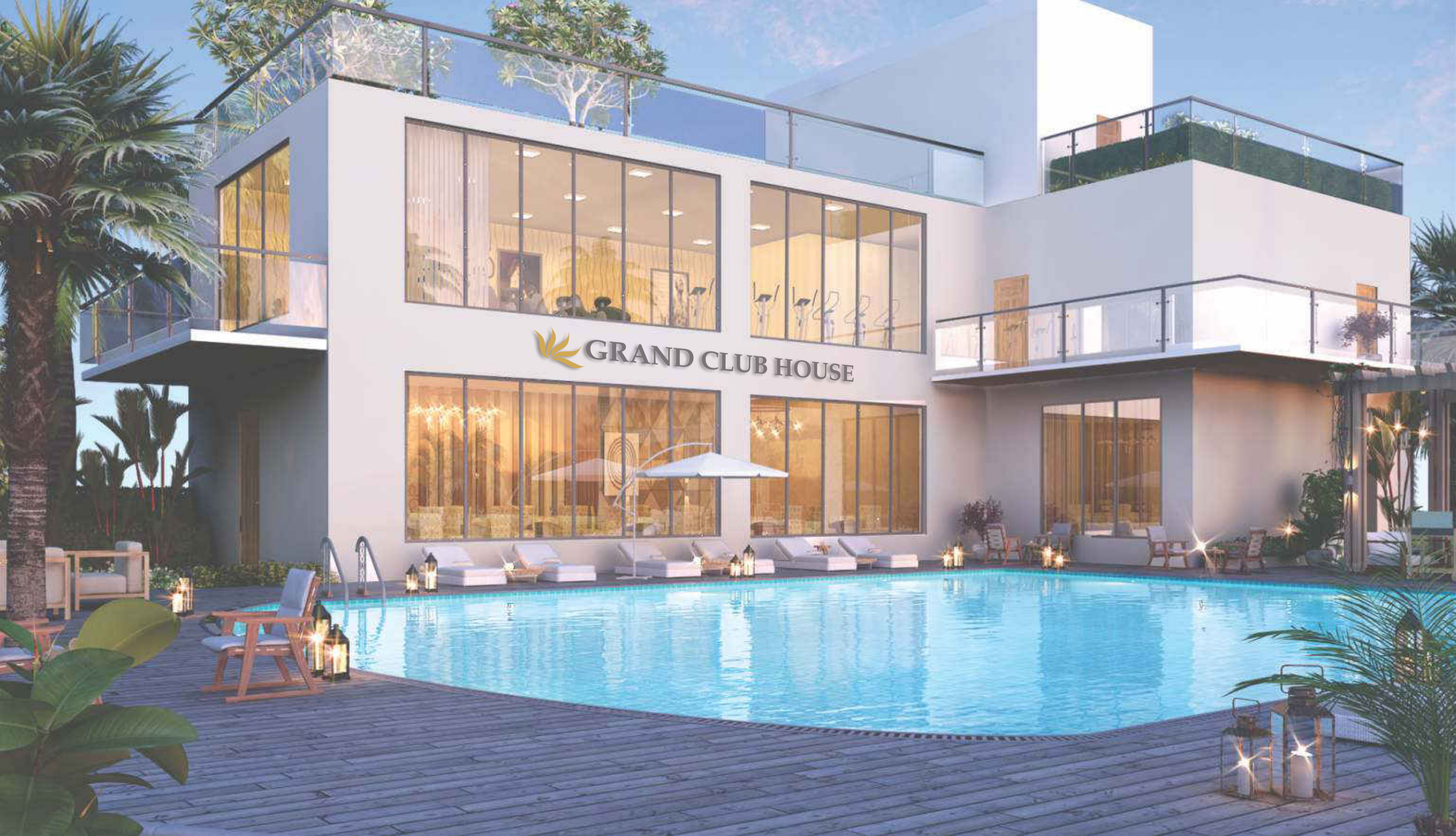
Grand Club House with Modern Features